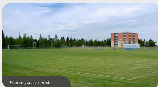
Primary soccer pitch