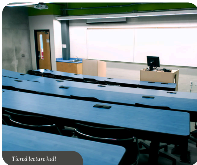
Tiered lecture hall

A wide variety of classroom styles and desk configurations